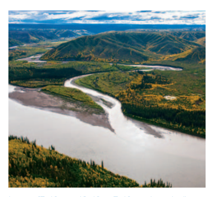
Junction of Trail River and Peel River. Trail River is known locally as 'Trail Creek'. This location is known in Gwich'in as Tr'atr'aataii Chik, 'mouth of the creek where the trail comes out (to Peel River)'.

The Board aims to compile a complete set of information for each place name it recommends for approval by the Minister, including pronunciation, meaning and historical/cultural significance, as well as visual documentation wherever possible.