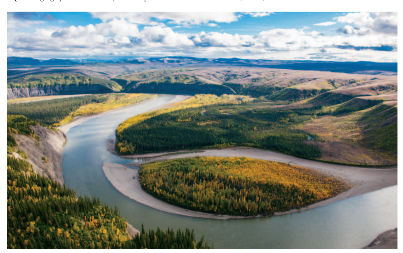
A view along the Peel River between the Snake and Bonnet Plume Rivers.