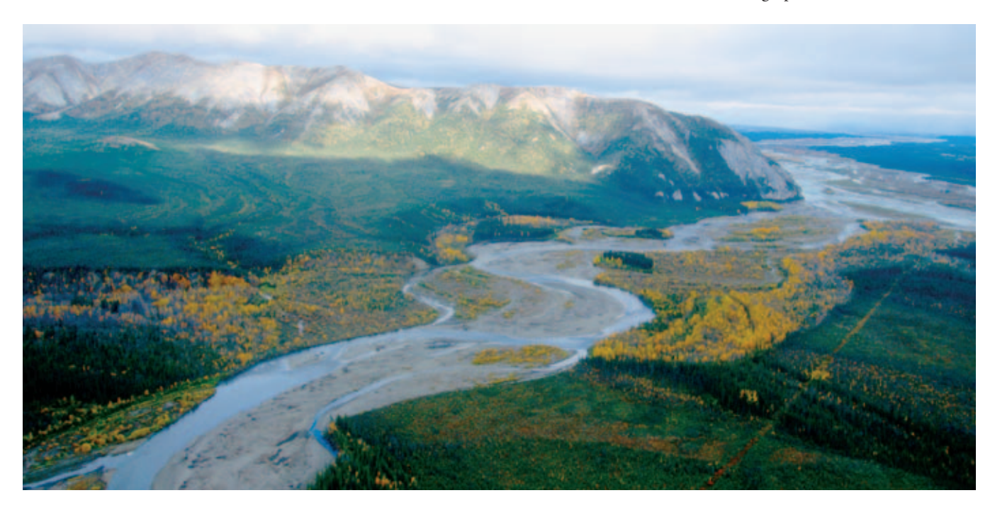
Autumn scene in the traditional territory of the Teetl'it Gwich'in in northern Yukon. Hungry Creek in the foreground flows east from Hungry Lake to join Wind River at far right. Hungry Lake is known as Van Choo, 'big lake', in the Gwich'in language. Hungry Creek is Van Choo Tshik, 'creek (flowing from) Hungry Lake.' Mount Deception at the junction is known as Vinidiinlaii, 'river current flows around its base.'