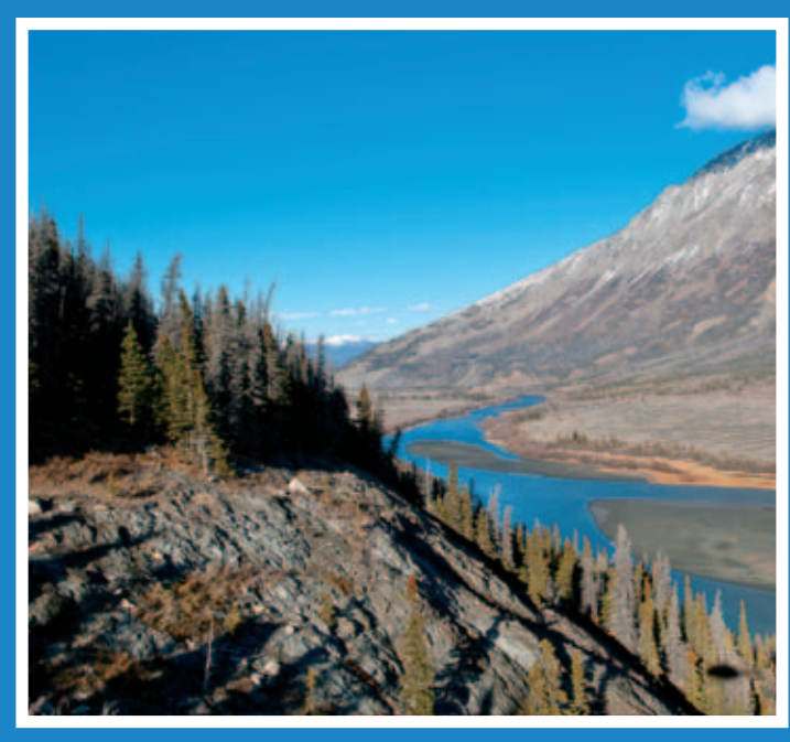
YGPNB and the Yukon Native Language Centre collaborate in documenting Yukon historical toponymy and geography. On these facing pages, the top left image shows a photo taken during E. J. Glave's expedition to the Yukon in 1891. Beside it is the corresponding engraving that appeared in his article in Century Magazine in 1892. The contemporary photo below was taken in October 2010 and shows the exact location visited by Glave over a century ago.